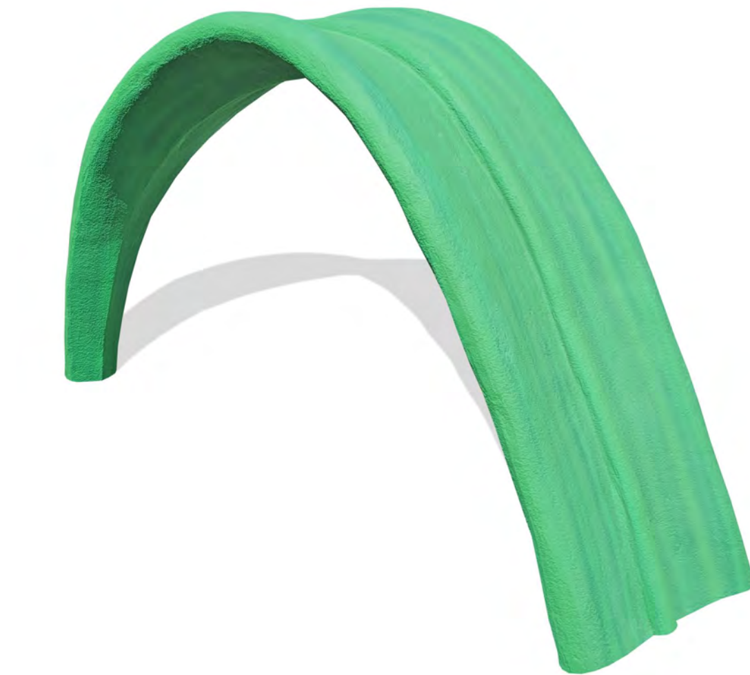
3 Grass Blade SML_SC018